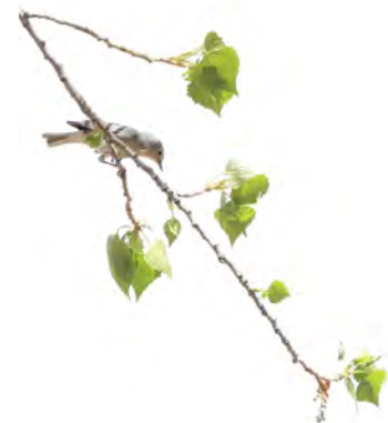
Early spring migration is underway: Lucy's Warbler in Fremont Cottonwood. Both have become more rare with the disappearance of southwestern riparian habitat.