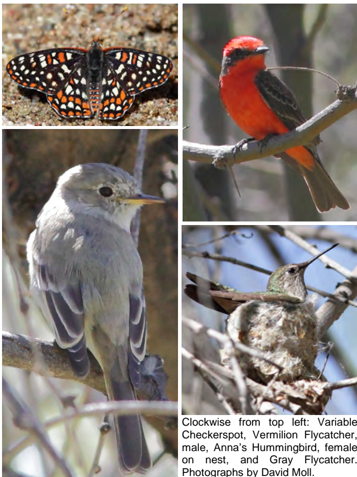
Clockwise from top left: Variable Checkerspot, Vermilion Flycatcher, male, Anna's Hummingbird, female on nest, and Gray Flycatcher.

All of our PAS field trip participants vowed to return with visiting friends or family, as this loop trip represents Arizona as well as any we've tried. We hope you give it a go, too. 🐦