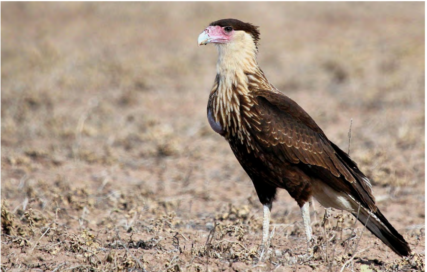
The Havasu Crested Caracara.